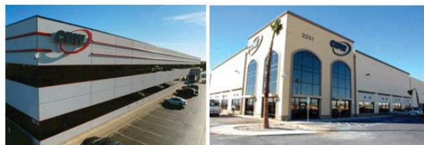
450,000-square-foot distribution center in IL

CDW holds $220M of inventory, on average, in our two CDW-owned distribution centers that total almost 1M square feet. Our ISO 9001, 14001 and 28000 certified strategically located distribution centers provide speed, accuracy, and excellent geographic coverage across the United States. We have access to more than 100,000 top brand-name products from more than 1,000 leading manufacturers.